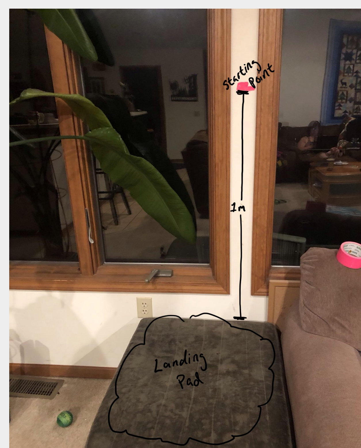
Figure 1: This is a setup by one of the students. The distance is marked 1m in this photo. We asked the students to repeat their calculation at least 5 times. Student's could use the “measure” App on their phone to measure 1 m.